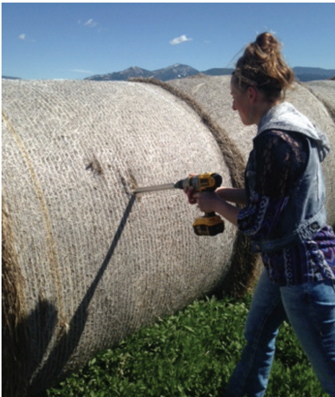
Figure 2. Forage sampling round bales. Collect sample from the curved side. The probe should be perpendicular to the surface.

Standing or windrowed forage samples from each field should be kept separate and then cut into 3-inch pieces, placed into your sampling bucket and mixed together to create a representative sample for each field. Samples can then be spread out on paper to air dry for two days or can be frozen prior to shipment for analysis. This will minimize any molding that may occur during shipment to the laboratory.