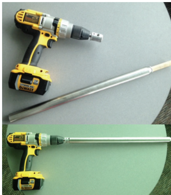
Figure 1. Picture of a typical mechanized hay probe set up, including the drill, probe, and dowel for removing the forage sample.

Proper forage sampling equipment includes a forage probe, a bucket, one gallon sized Ziploc sample bags, and drill (depending on the type of probe). A forage probe connected to a drill