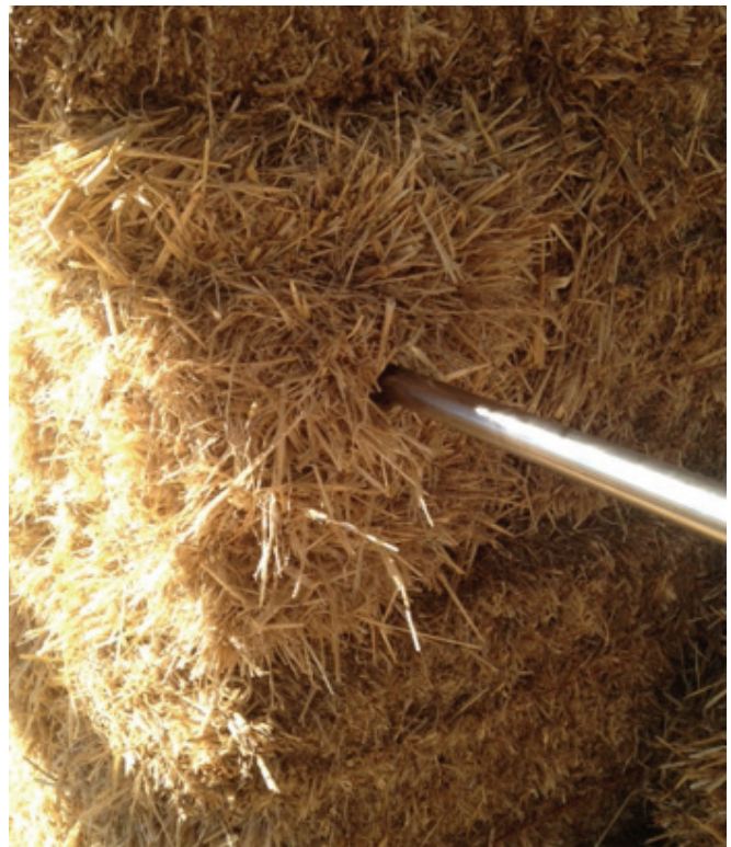
Figure 3. Forage sampling small square bales. Collect sample from the small end of the bale.