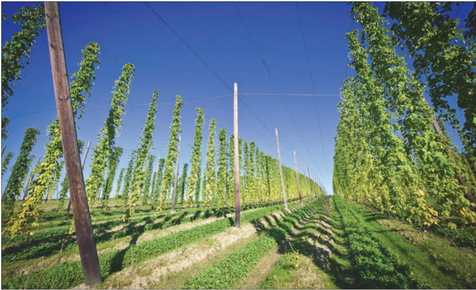
THE COMMERCIAL HOPS field trial at the Britz Ranch near Whitefish will use a trellis system with 18-foot poles similar to this one shown at a hops field in Austria. The local research aims to determine if commercial varieties of hops favored by craft beer brewers can be successfully grown in Western Montana.