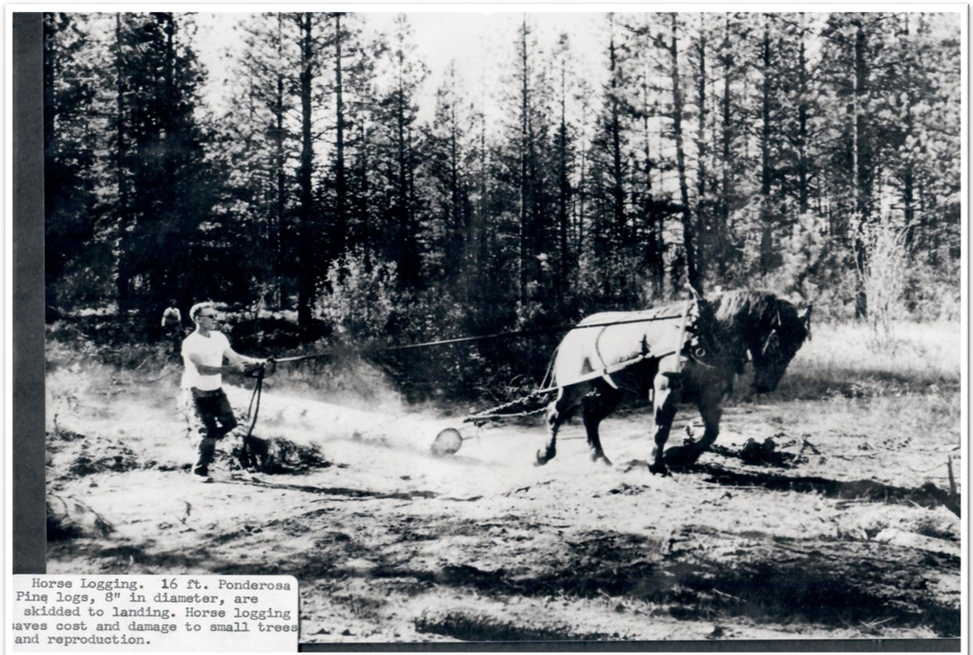
Horse Logging. 16 ft. Ponderosa Pine logs, 8" in diameter, are skidded to landing. Horse logging saves cost and damage to small trees and reproduction.

By: Peter Kolb (Ph.D.), MSU Extension Forestry