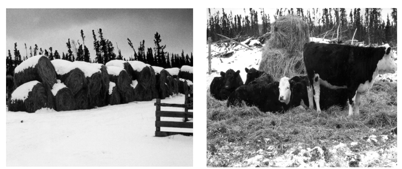
Large round bales are efficient and easy to handle with the right equipment. They must be fed from feeders to avoid excessive waste.

A one to one (1:1) calcium phosphorus mineral supplement may also be provided free-choice, although both calcium and phosphorus requirements are being met in these rations.