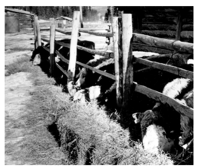
These young calves wintered well on high quality grass hay plus vitamin and mineral supplementation.

Most calf rations require mineral supplementation. Whenever possible, the minerals should be mixed in the grain portion of the ration. Minerals should also be offered free-choice. If you are feeding a considerable amount of legume forage, use a mineral supplement containing equal parts of calcium and phosphorus. A ration based on a grass hay, greenfeed or cereal silage should be supplemented with a mineral containing two parts of calcium and one part of phosphorus. When a ration contains two-thirds or more of grain it should contain 1 percent ground limestone. Trace mineralized (TM) salt should be available free-choice, or be added to the grain mix. Be sure the salt does not contain more than 0.02 percent iodine. Supplemental selenium should be included in the ration at a rate not to exceed 0.3 ppm whenever Alaska feeds are fed.